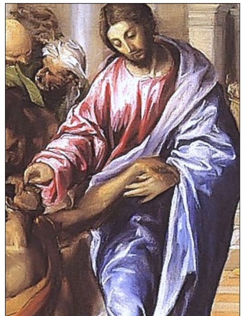
El Greco, Healing the Blind Man (1570) "The blind man replied" Master, I want to see." Jesus told him, "Go your way; your faith has saved you." (MK 10:46-52)

847 South Holland Avenue, Springfield, MO 65806